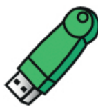
Software Protection Key