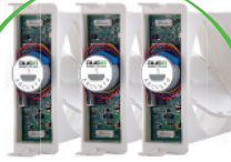
DC-VAV CO2 30